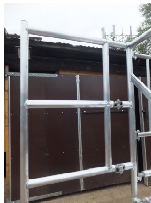
FOLDING SIDE FRAMES