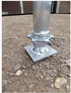
ADJUSTABLE LEG AND PLATE