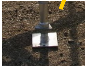
LEG AND BASEPLATE