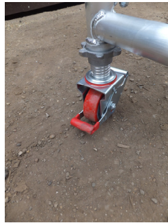
ADJUSTABLE LEG AND CASTOR