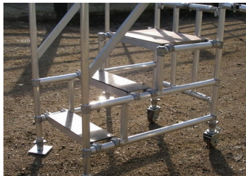
STEPS UP TO TRAILER