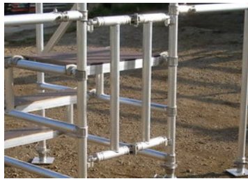
FOLDING BACK FRAME