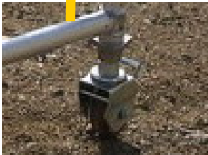
LEG AND CASTOR