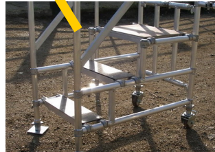
STEPS AND PLATFORM